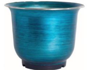
Color: Blue Code: BBL

Available Colors: Blue, Silver (not pictured)